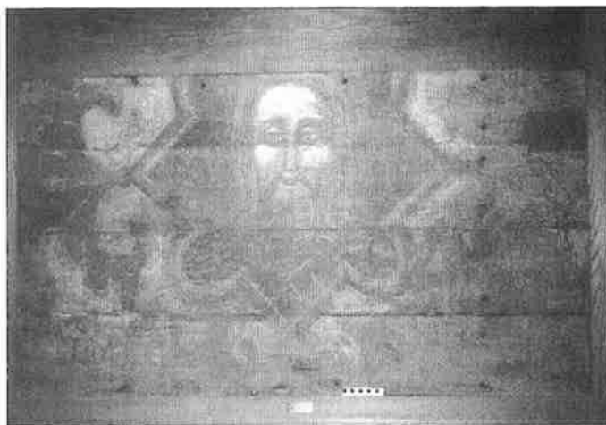
Fig. 1 : The Templecombe Panel Icon at St. Mary's Church, Templecombe, Somerset, England, photographed without glass cover.

During 1987 I discovered new evidence which has helped to shed some further light on an obscure period of the Shroud's history and this led me to speculate, in August of that year 6 that the Shroud itself might once have been in England, a speculation which I have not found in